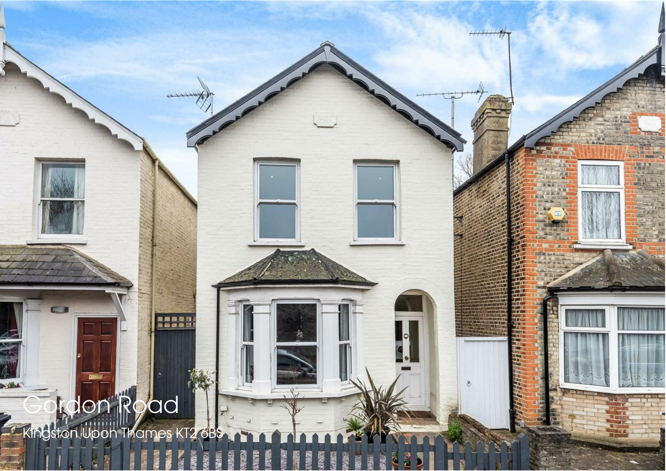
Gordon Road Kingston upon Thames KT2 6BS

34 Richmond Road Kingston upon Thames Surrey KT2 6ED www.gibsonlane.co.uk Tel: 020 8546 5444